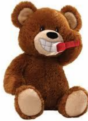
BRUSH YOUR TEETH